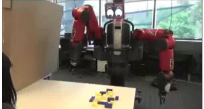
Fig. 1: Anthropomorphism in robots is a double-edged sword, leading to both smooth interaction with humans and unrealistically high expectations due to human mental models that generalize capabilities from humans to social robots.

Often, however, socially intelligent robots give the impression that they are more intelligent than they really are. For example, research has found that perceptions of animacy and intelligence are closely related and simply making a robot more human-like in its appearance and behavior increases perceptions of intelligence [1]. It is therefore likely that in many situations people’s perceptions of a robot’s intelligence and its actual capabilities are not well aligned. The question of how a robot’s embodiment and behavior shapes perceptions of specific capabilities is underexplored. We therefore introduce the term expectations gap to describe this under-studied phenomenon that occurs when humans encounter complex engineered systems and form expectations that are misaligned with the system’s capabilities. Today’s engineers build robots to be good at specific capabilities. In contrast, humans are generally adept at a broad set of capabilities. Humans also have a tendency to assign agency to, or anthropomorphize, human-like objects [5], including robots [7]. When seeing robots that seem sociable or anthropomorphic, it is easy for us to generalize human mental models to robots [2]. We normally trust others to be able to perform a common set of core capabilities, such as speaking or walking. Therefore, when attributing a human mental model to a robot, we hypothesize